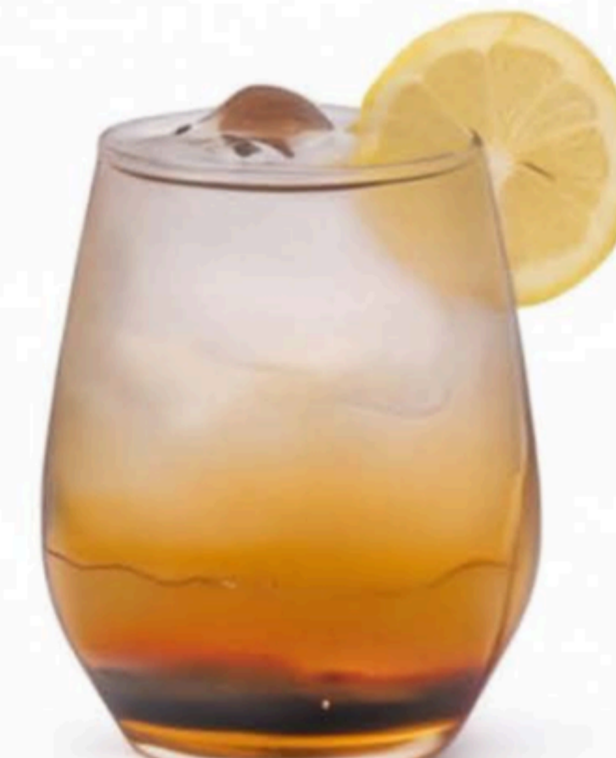
$8.80 Peach Black Tea