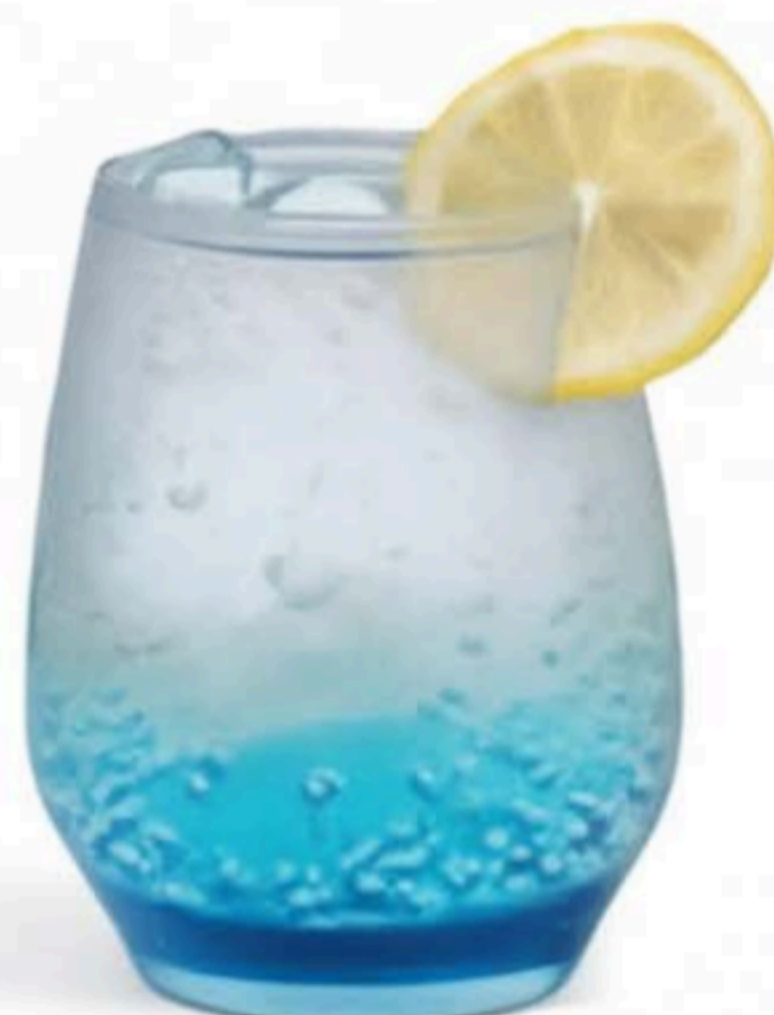
$8.80 Blue Lemonade