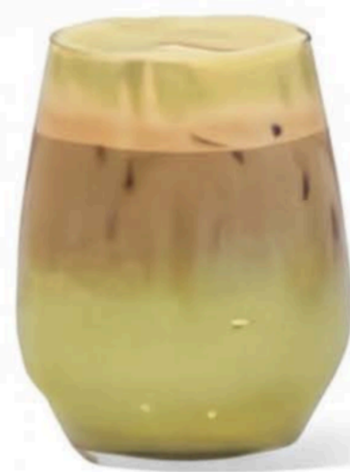
$8.80 Matcha Flat