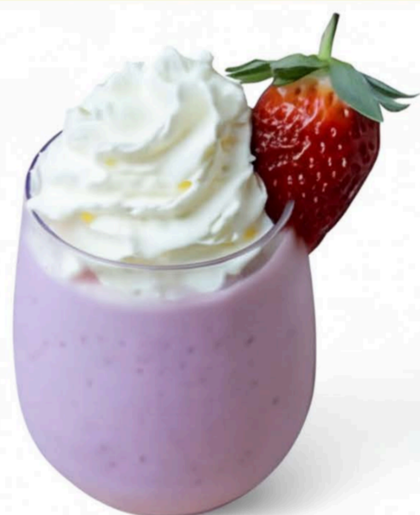
Strawberry Yogurt $8.80