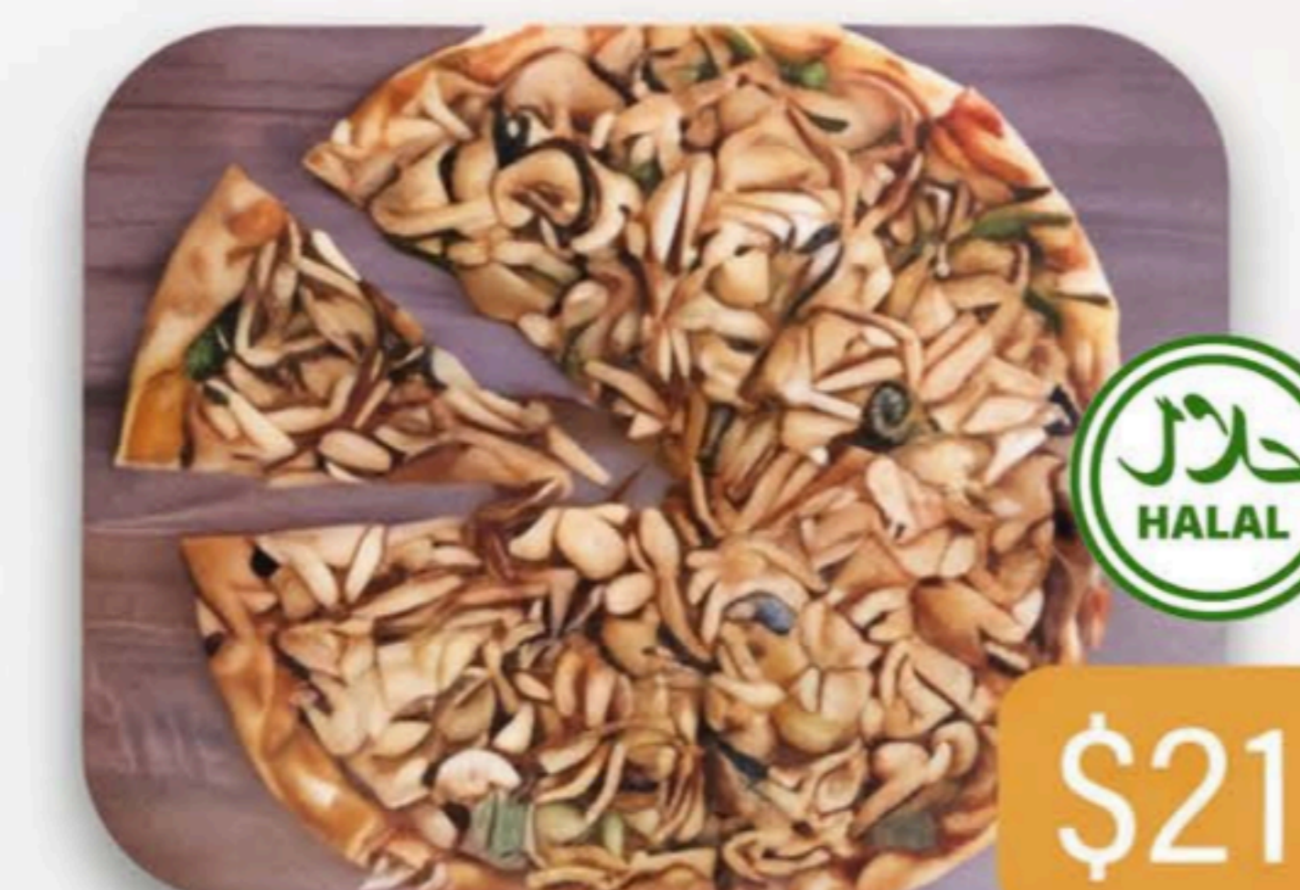
BBQ CHICKEN Grilled Chicken, Onion, Baby spinach and mushroom with BBQ base