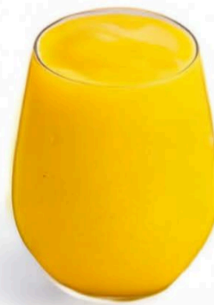
$8.80 Mango Smoothie