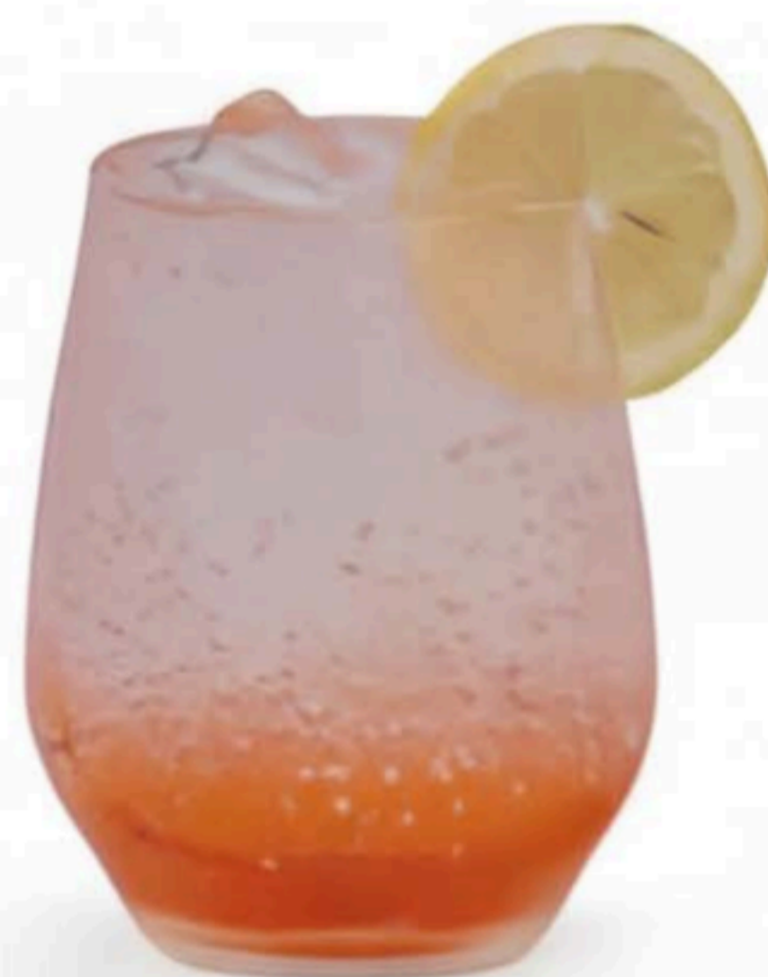
$8.80 Lemon Lime Bitters