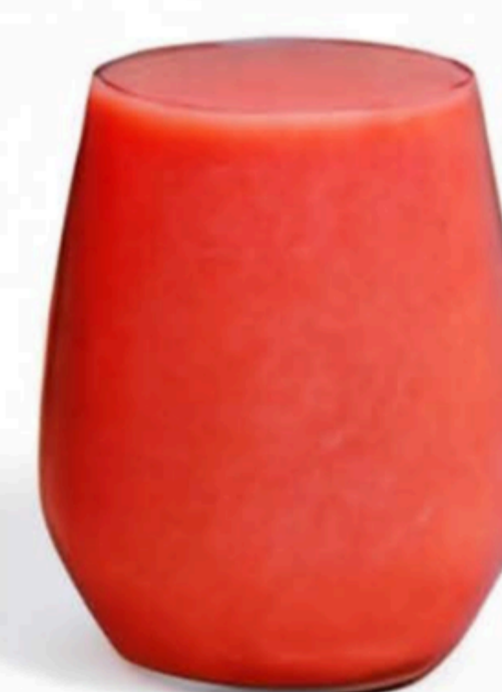
$9.80 Watermelon Lychee