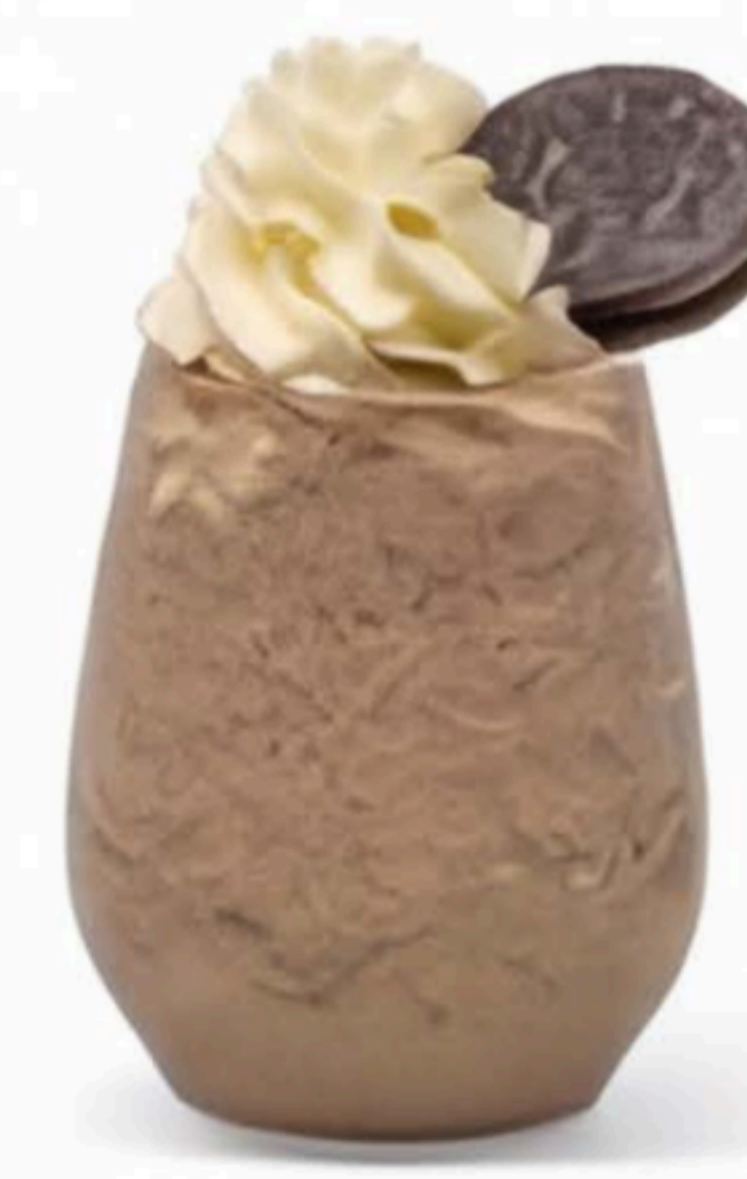
$8.80 Cookies and Cream