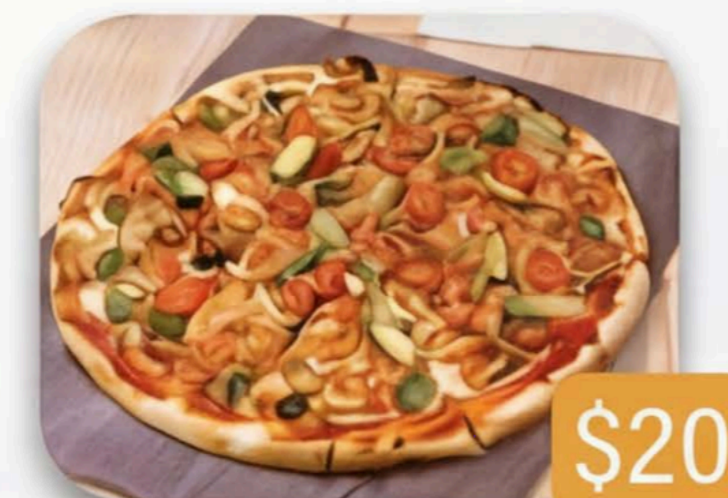
SUPREME Ham, Pineapple, Mushroom, Spinach, Olives, Onion, with Tomato Base