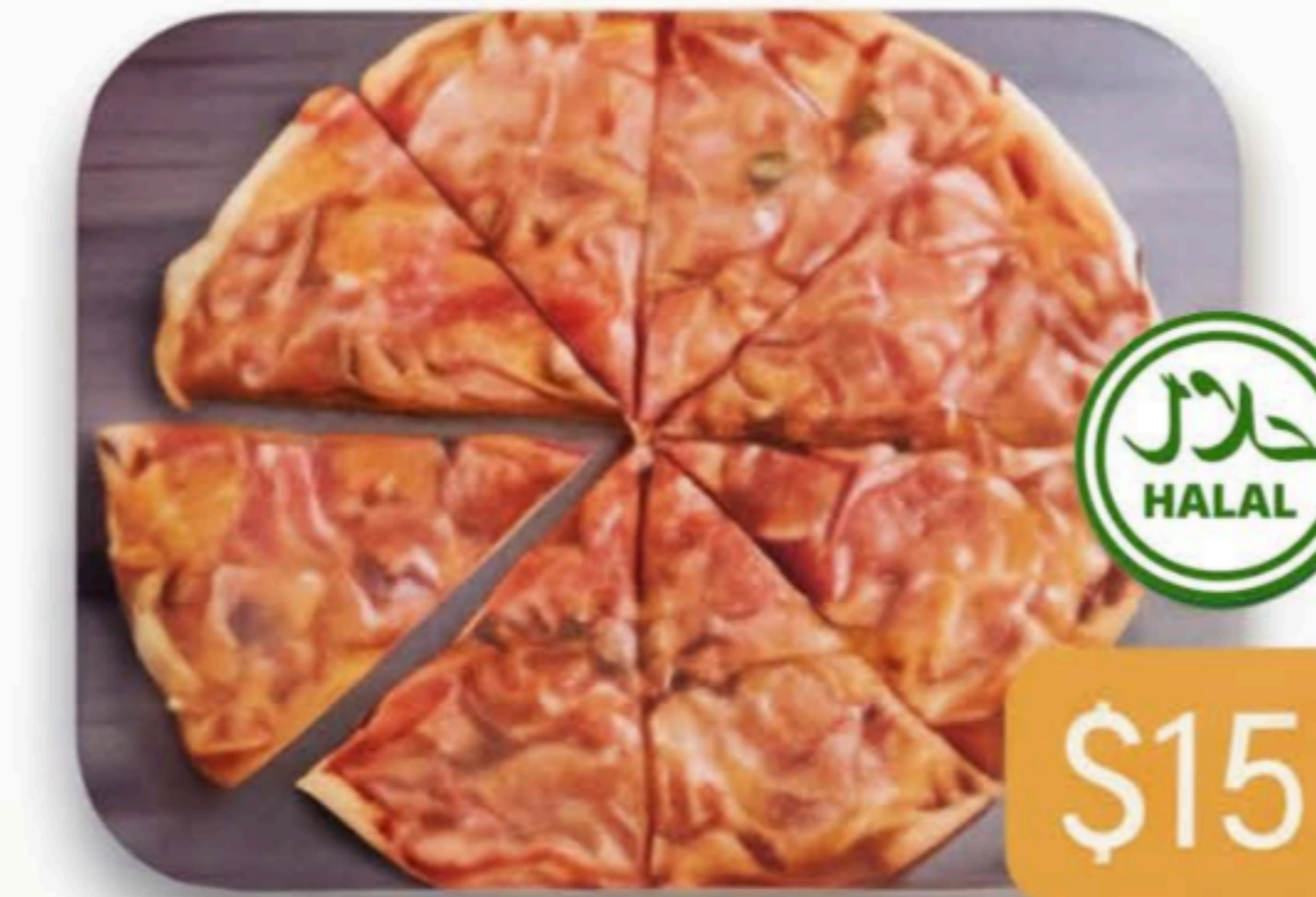
MARGARITA Cheese with Tomato Base