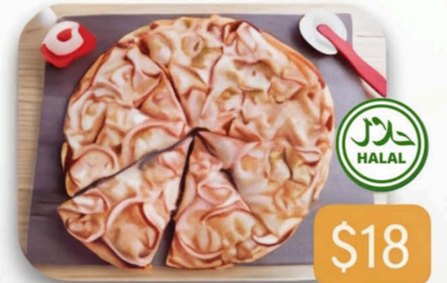
HAWAIIAN Ham & Pineapple, with Tomato Base