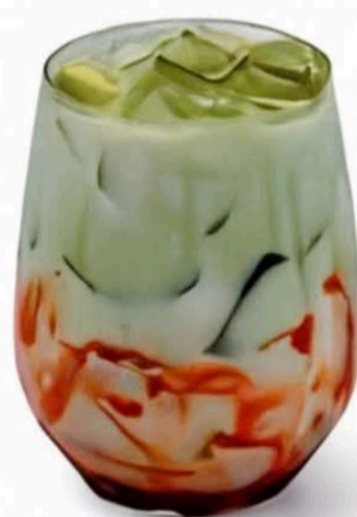
$9.80 Strawberry Matcha