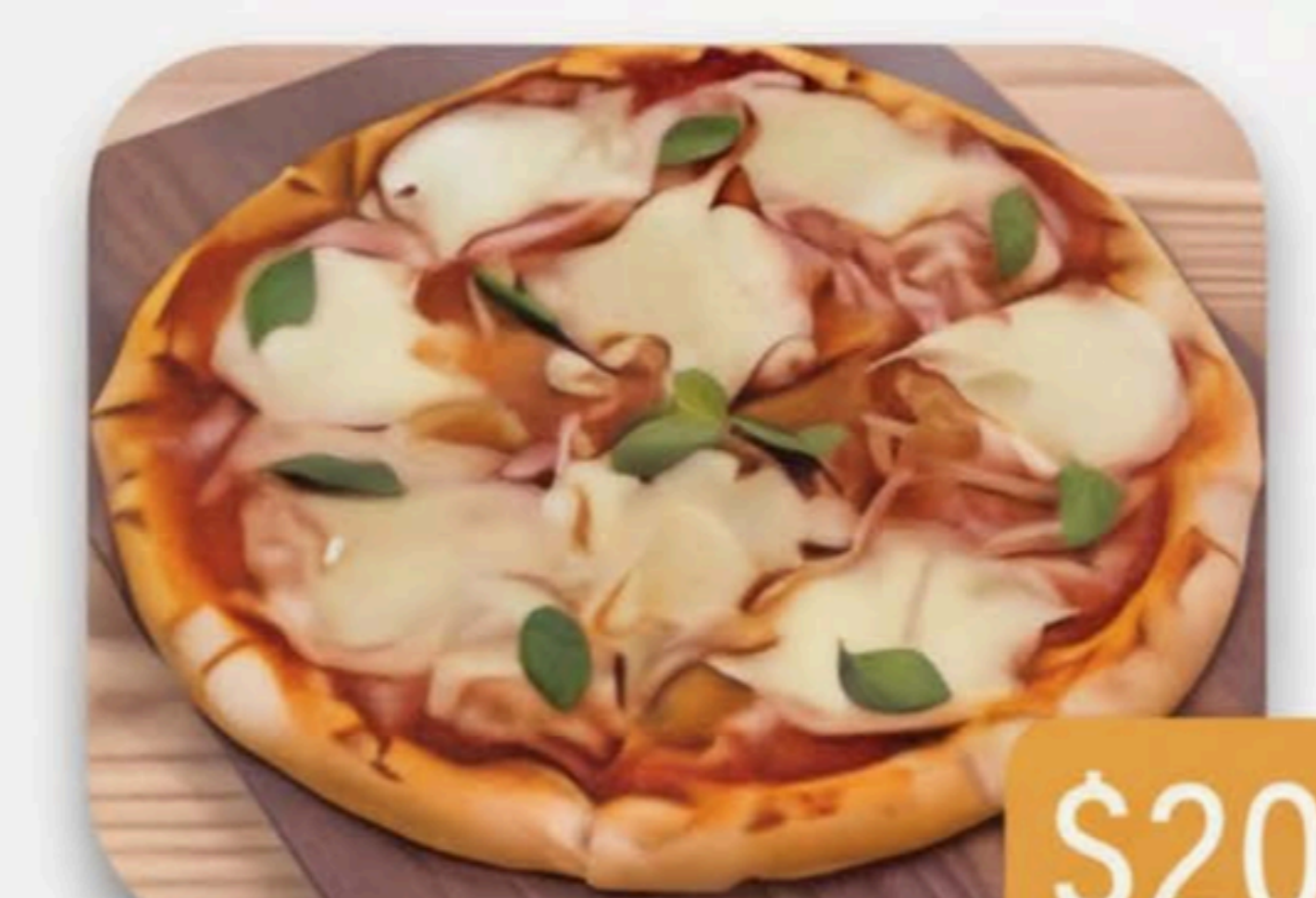
SALAMI WITH CHEESE (CHILLI) Salami, Cheese with Tomato Base