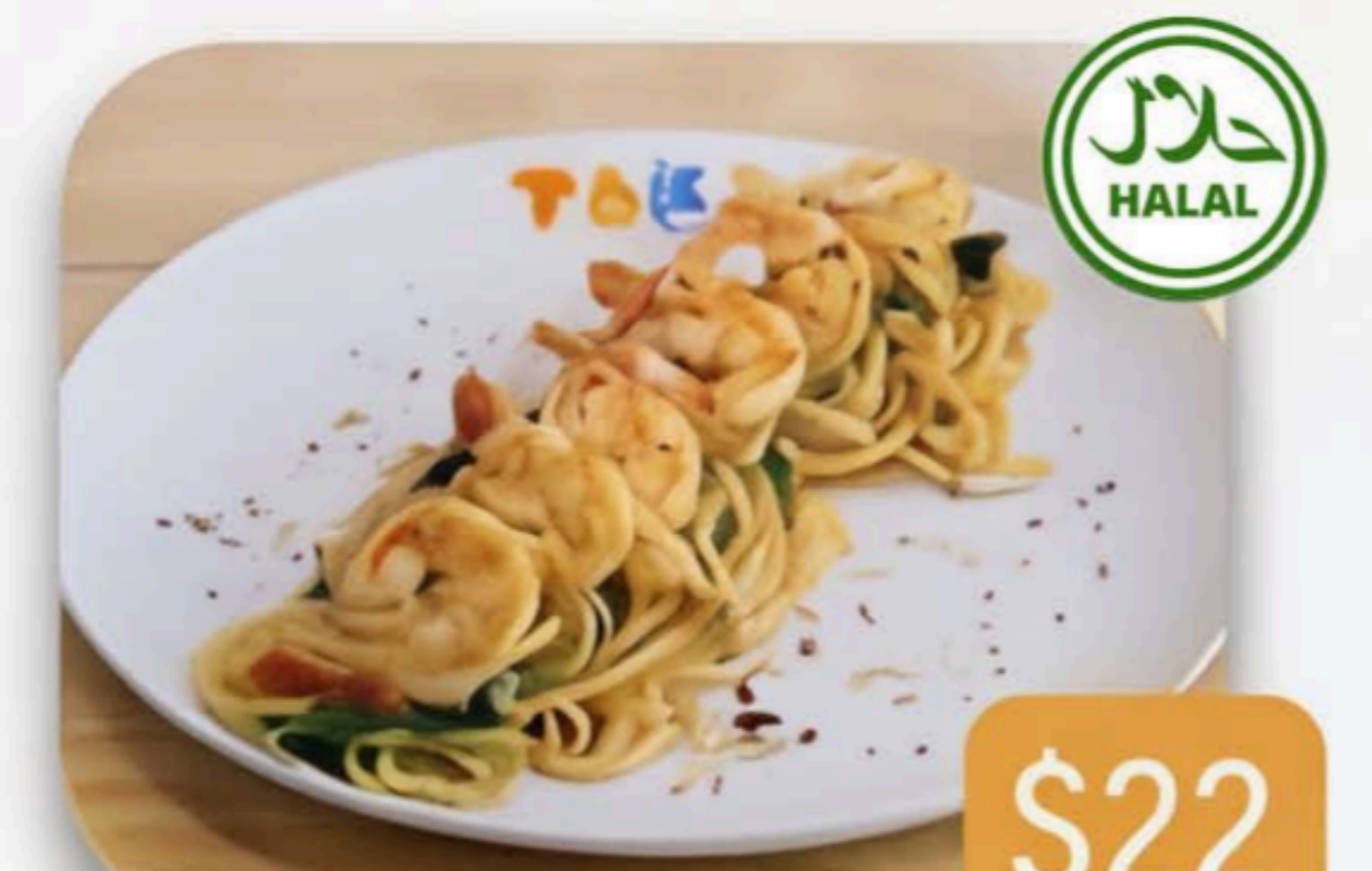
CREAMY PRAWN SPAGHETTI Grilled Prawn, Baby Spinach, Chilli Flake, stir with Creamy Sauce and Parsley