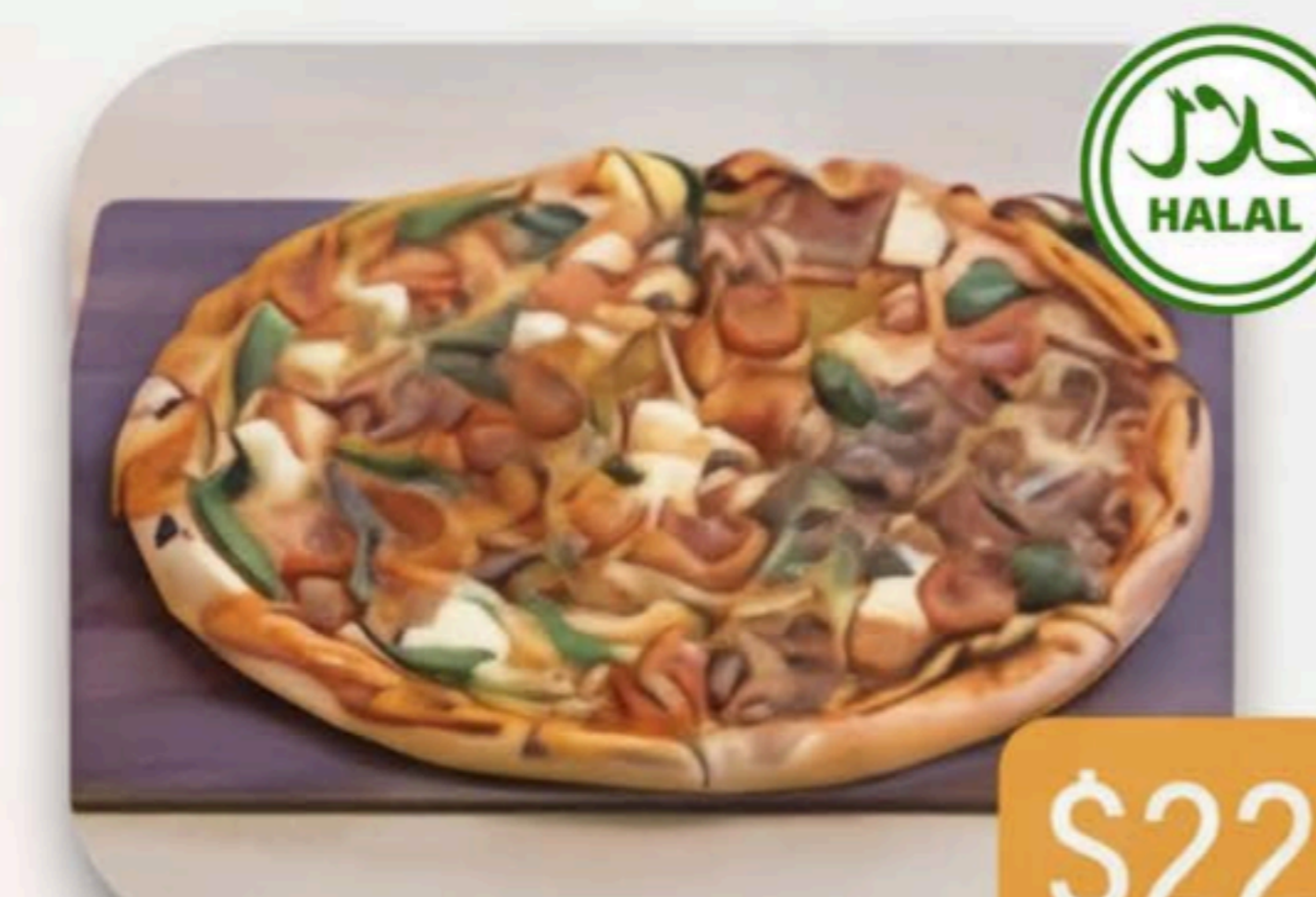
GARLIC PRAWN Grilled Prawn, Baby Spinach, Cherry Tomato, Chilli Flake with Tomato Sauce