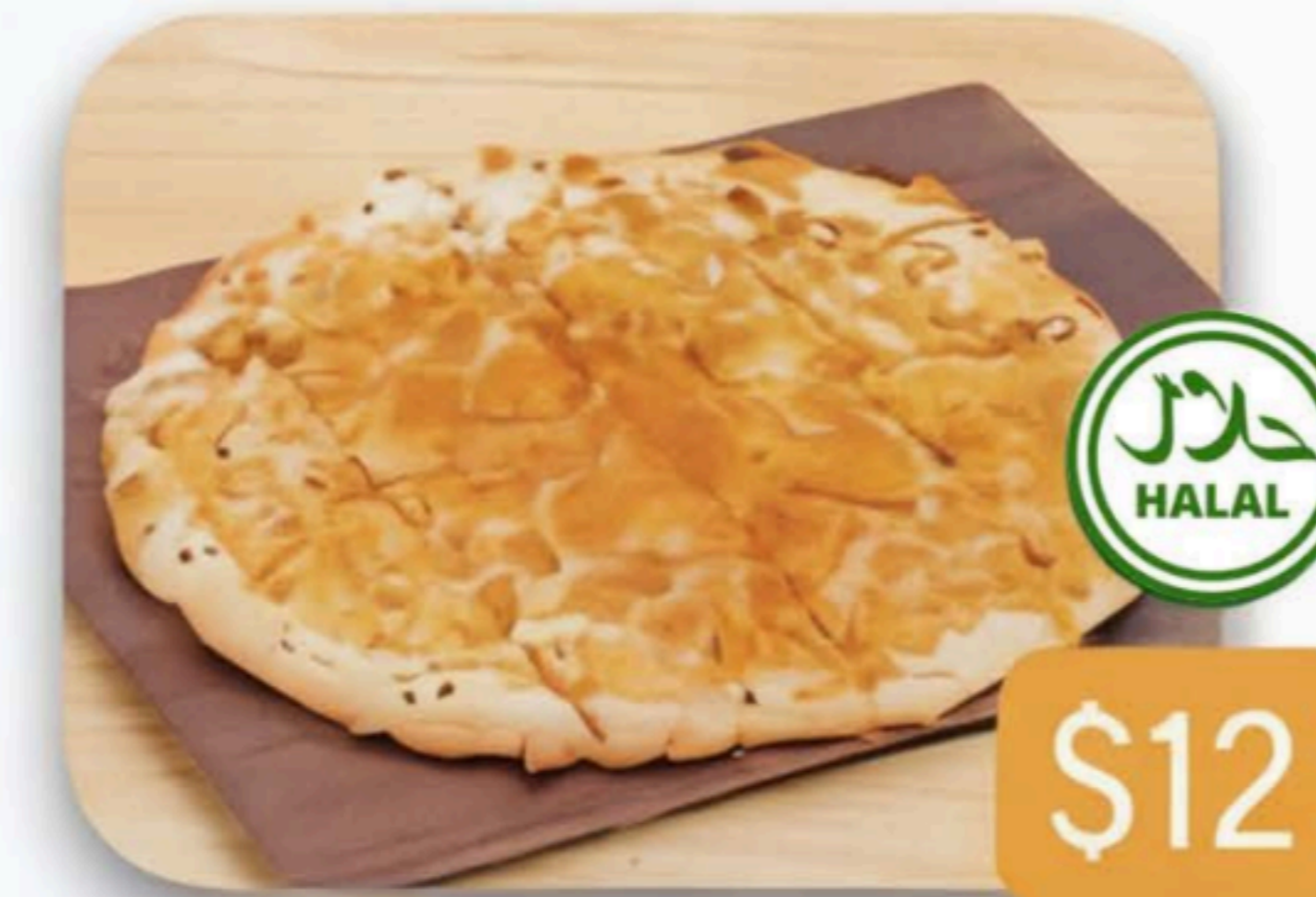
GARLIC PIZZA Fresh Garlic with Butter