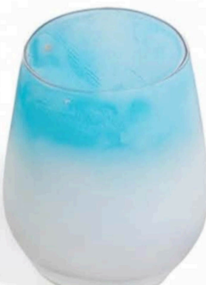
$9.80 Sky (Lychee Frappe)