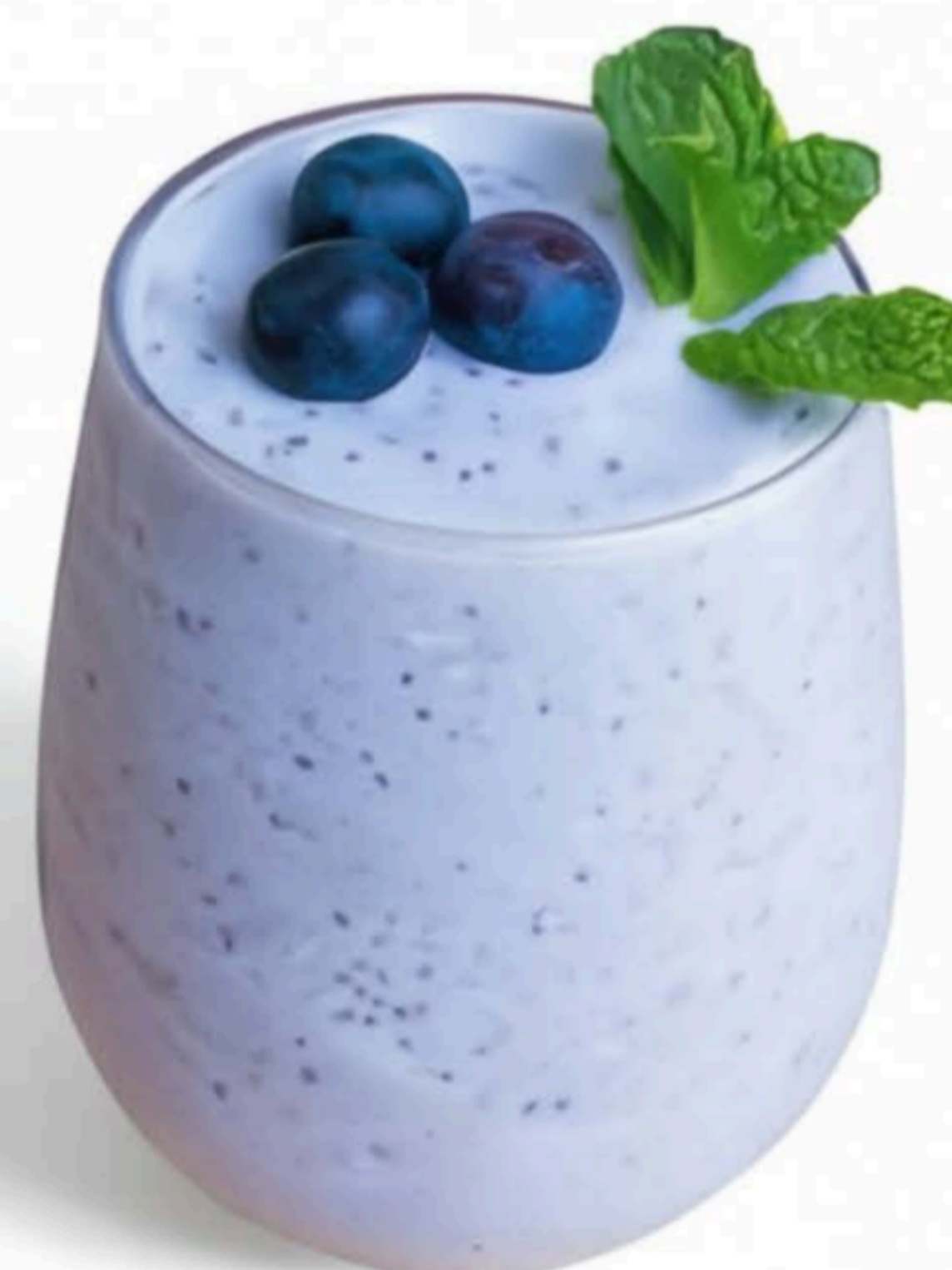
Blueberry Yogurt $8.80