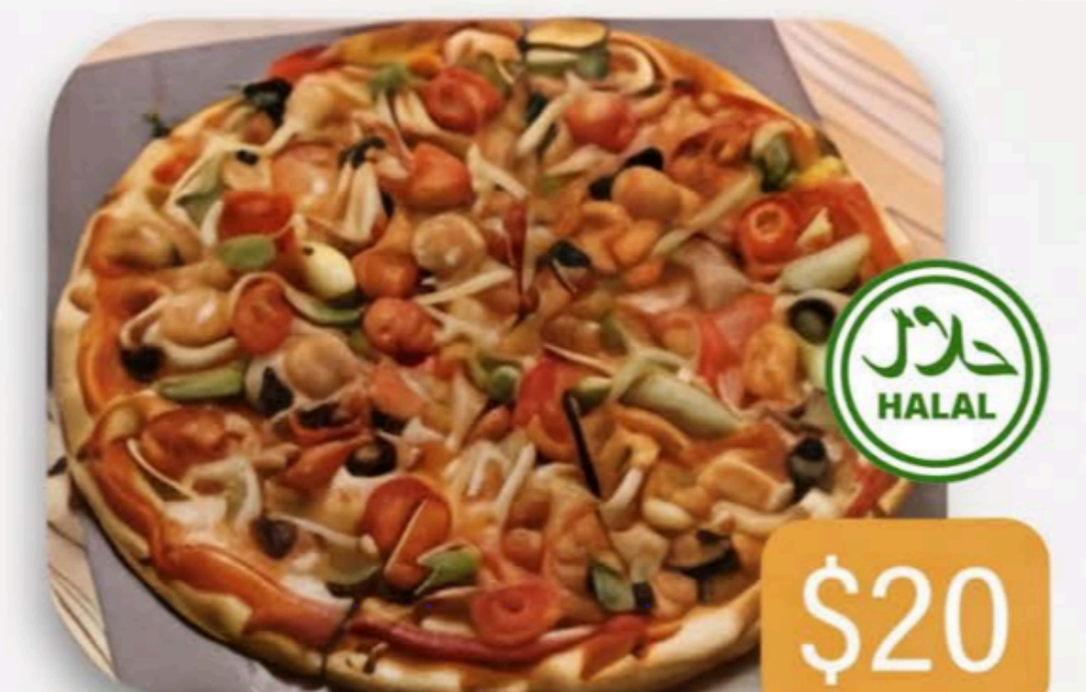
VEGETARIAN PIZZA Spinach, Cherry Tomato, Onion, Olives, Pineapples with Tomato Base