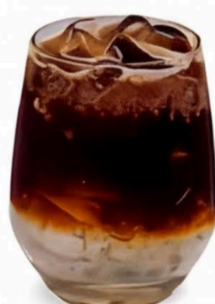
$9.80 Lychee Espresso Fizz