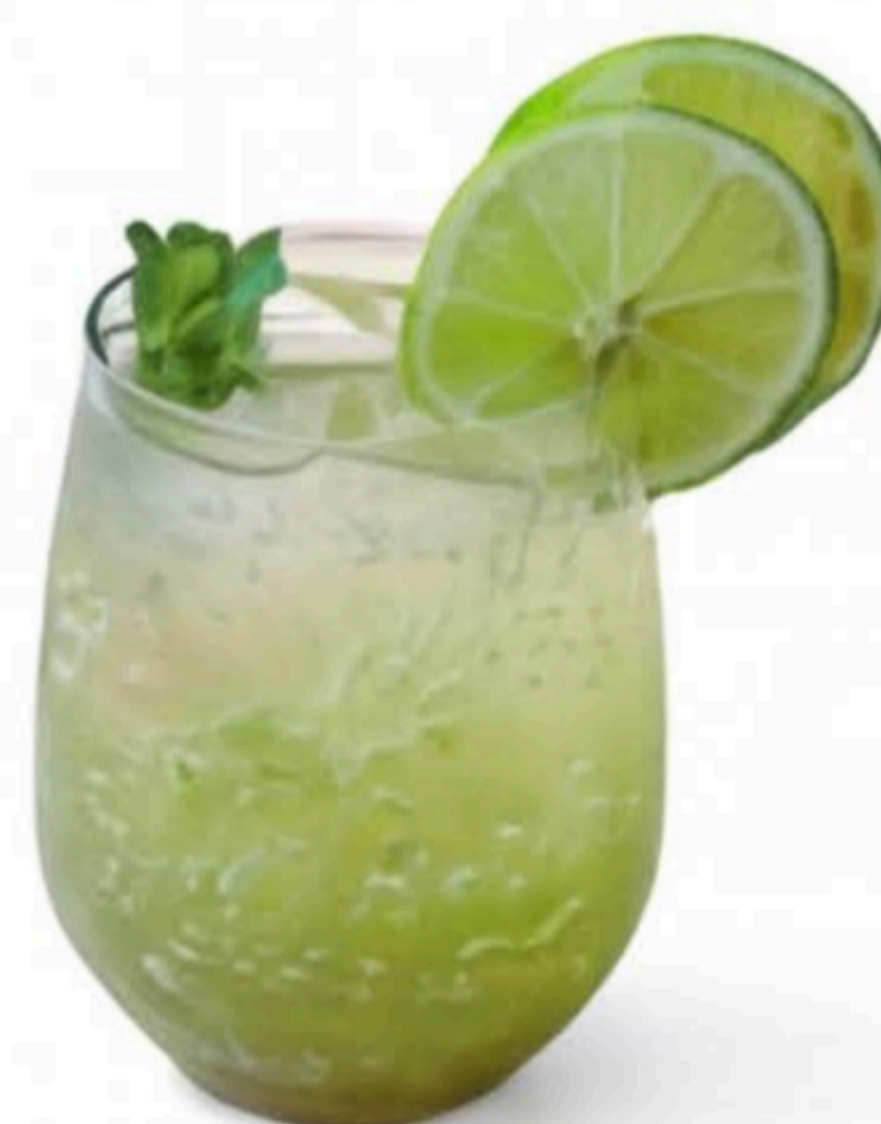
$8.80 Green Grapes Ade