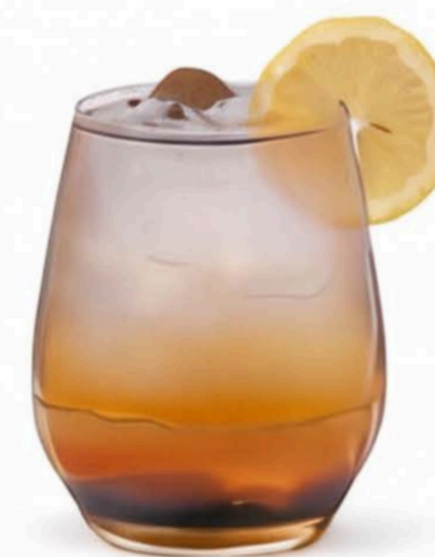
$8.80 Peach Black Tea