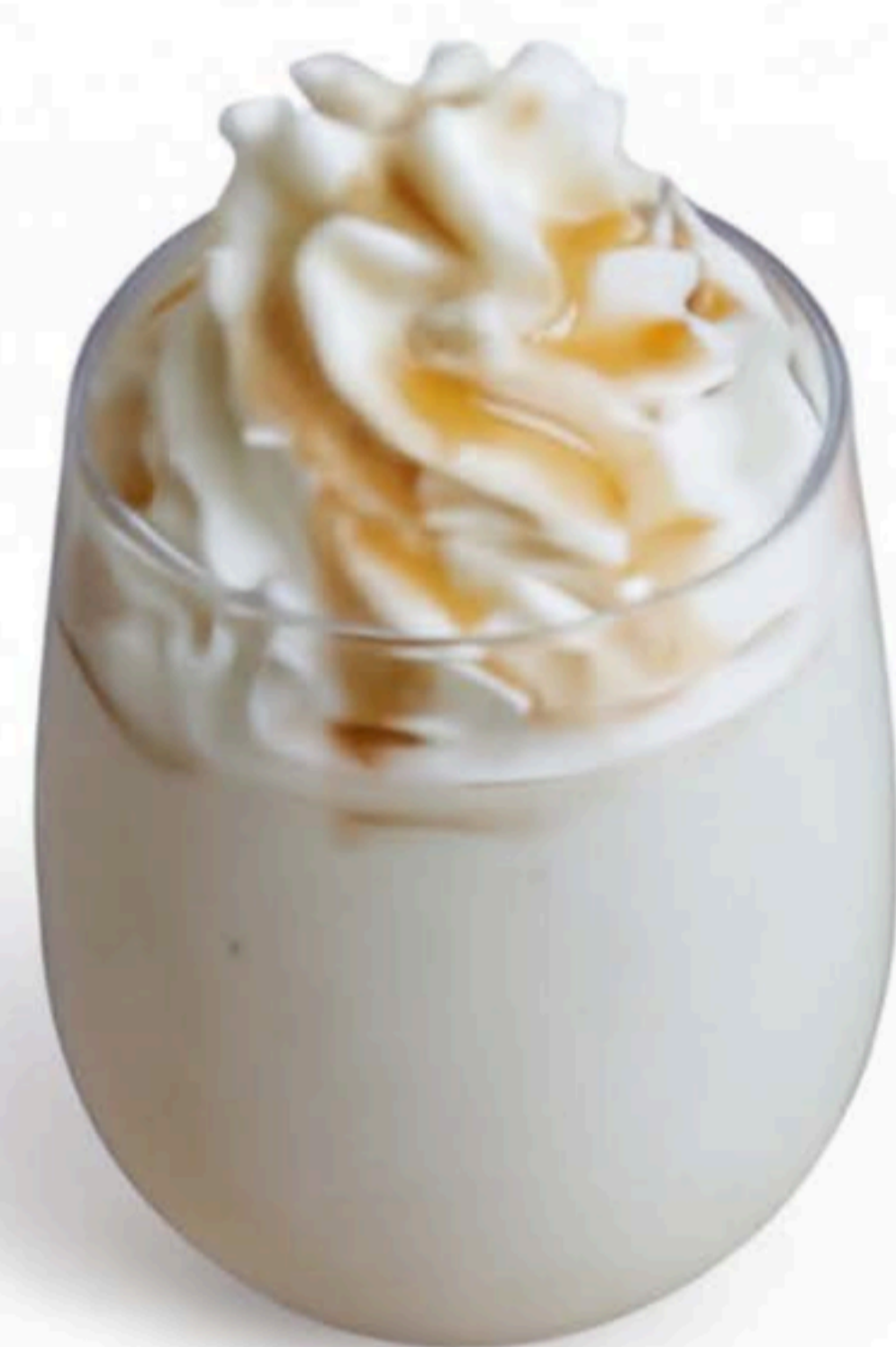
Natty Banana Yogurt $8.80