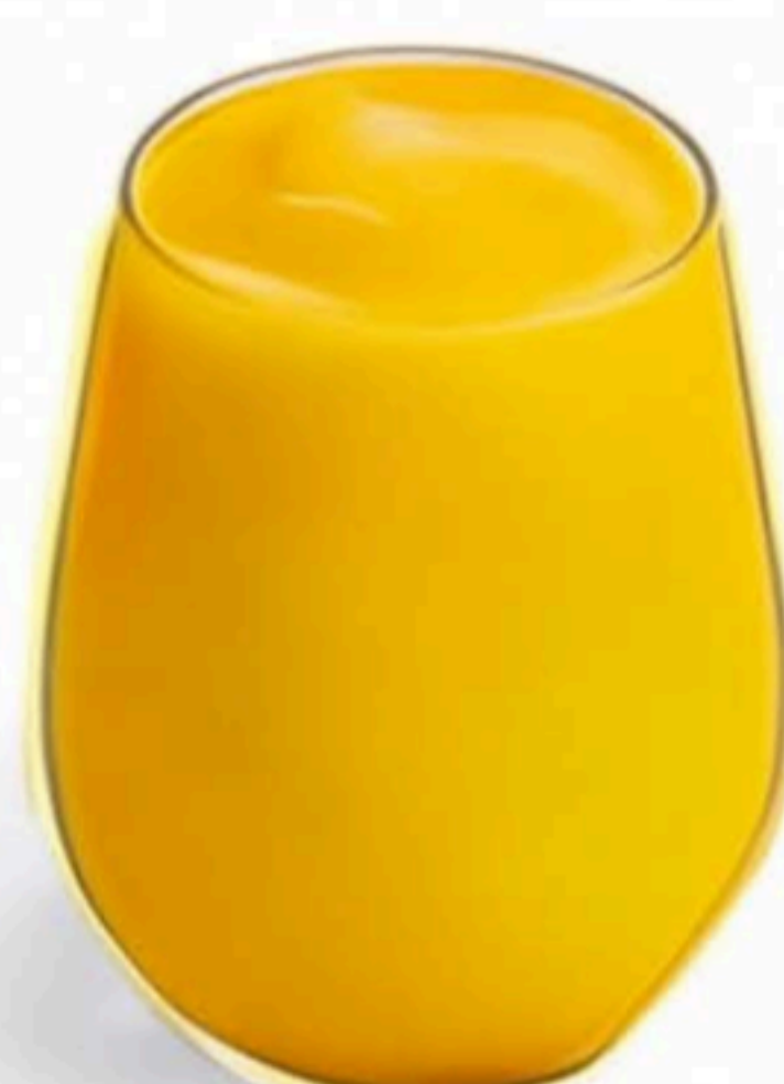
$8.80 Mango Smoothie