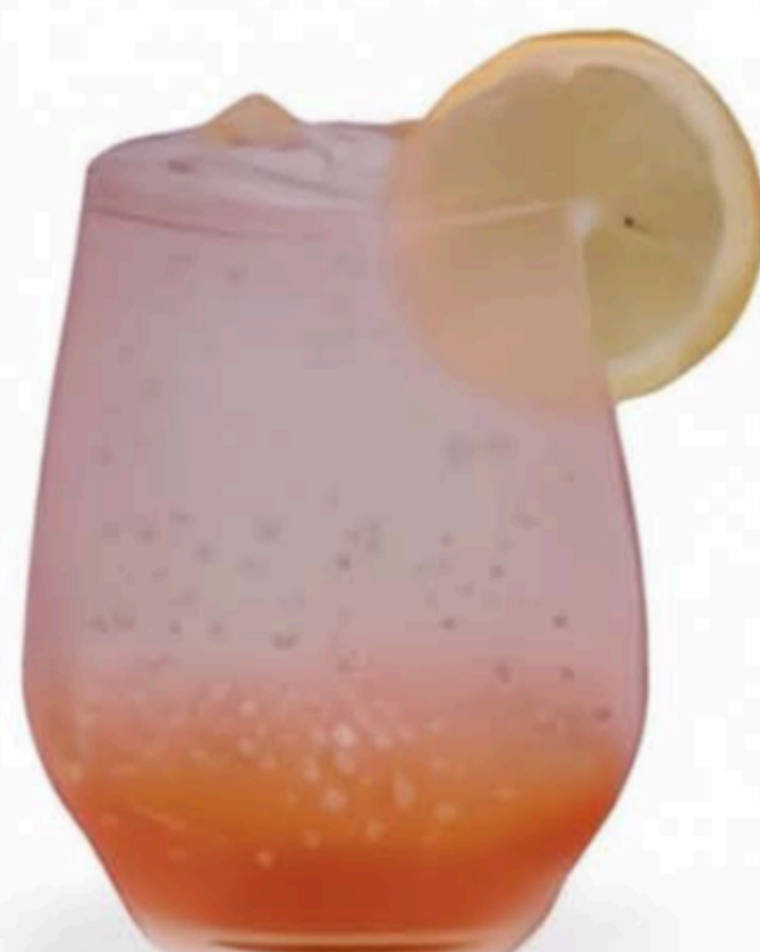
$8.80 Lemon Lime Bitters