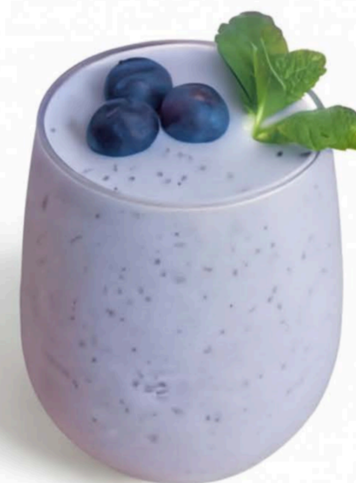
Blueberry Yogurt $8.80