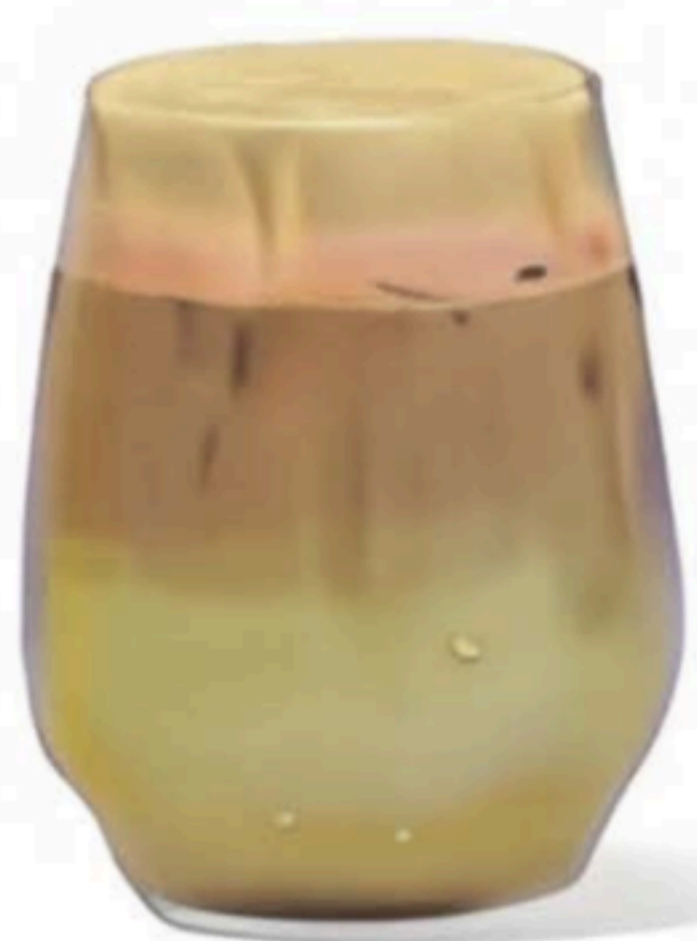
$8.80 Matcha Flat