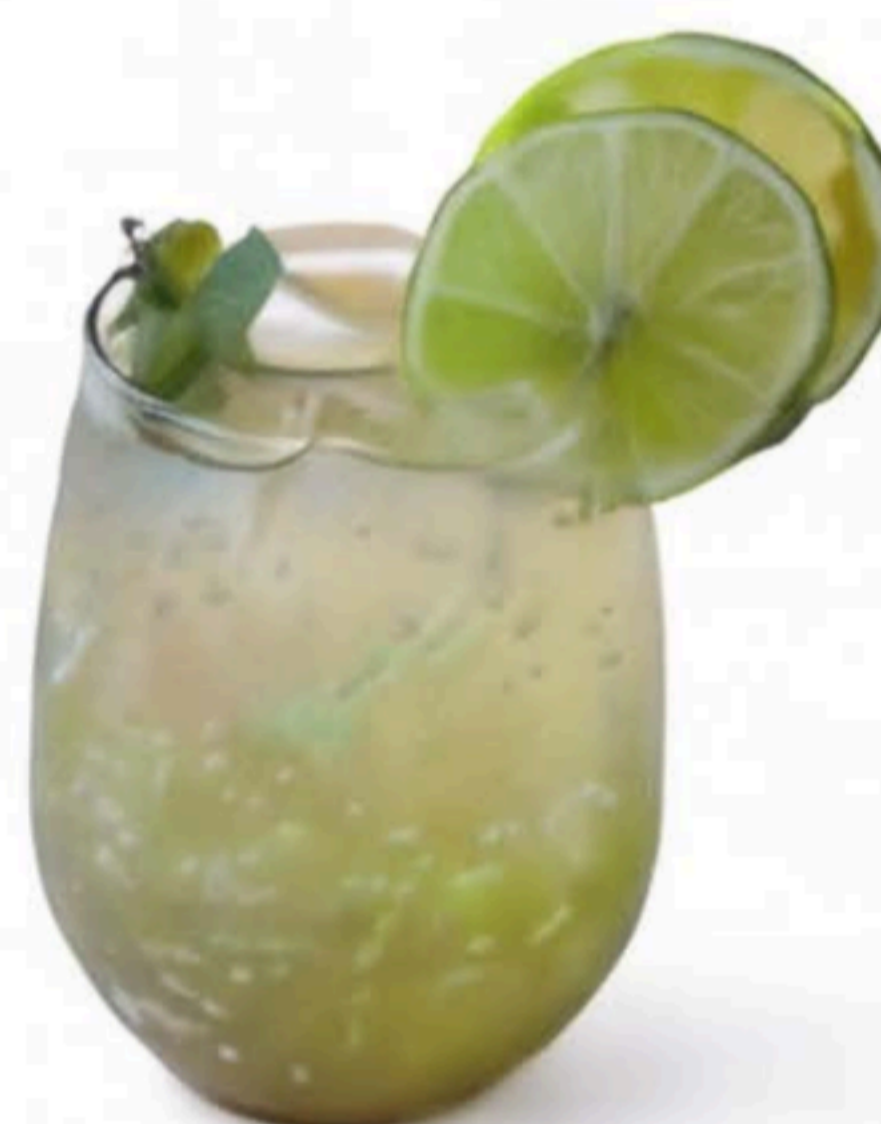
$8.80 Green Grapes Ade