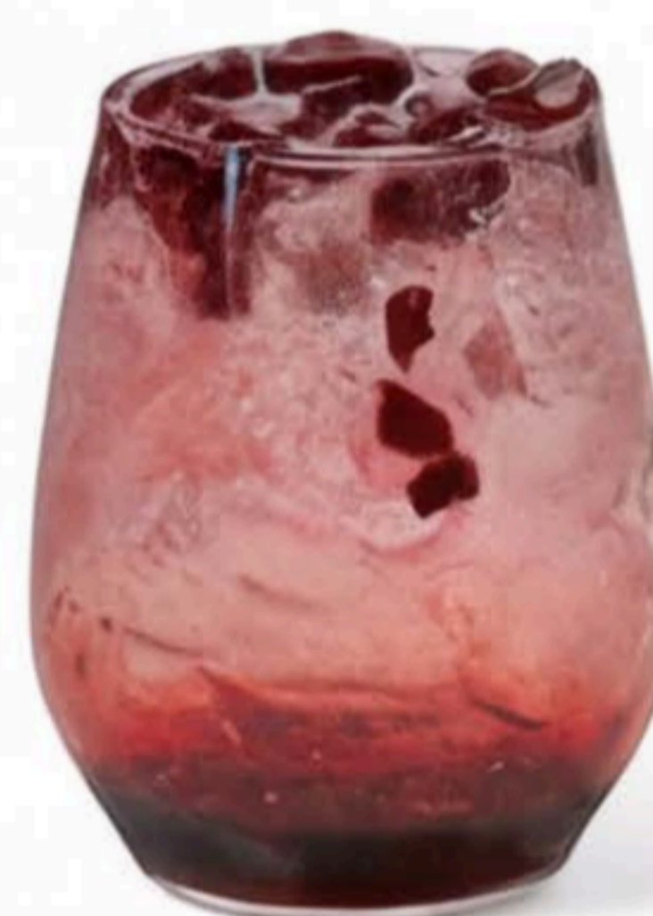
$8.80 Pomegranate Ade