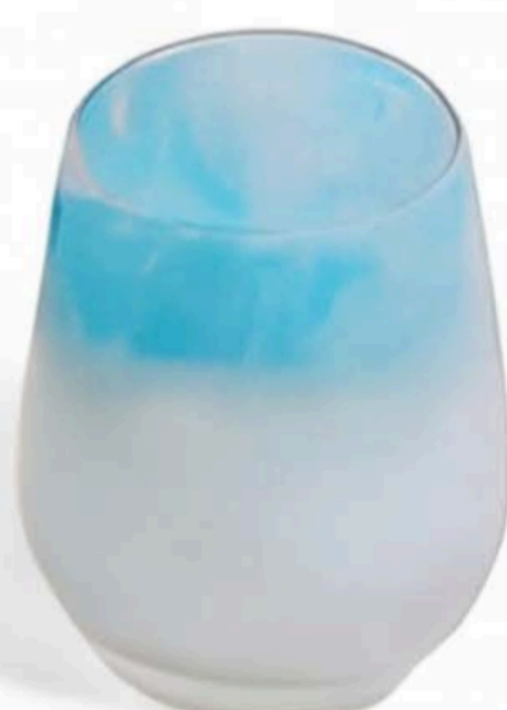
$8.80 Sky (Lychee Frappe)