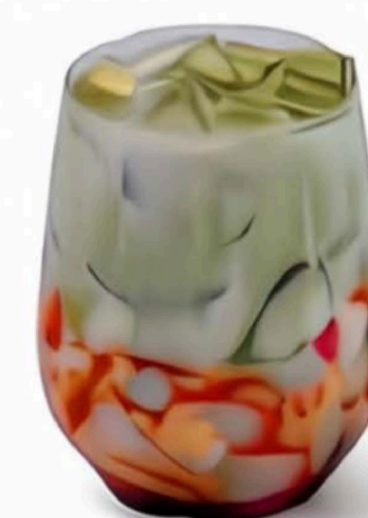
$9.80 Strawberry Matcha