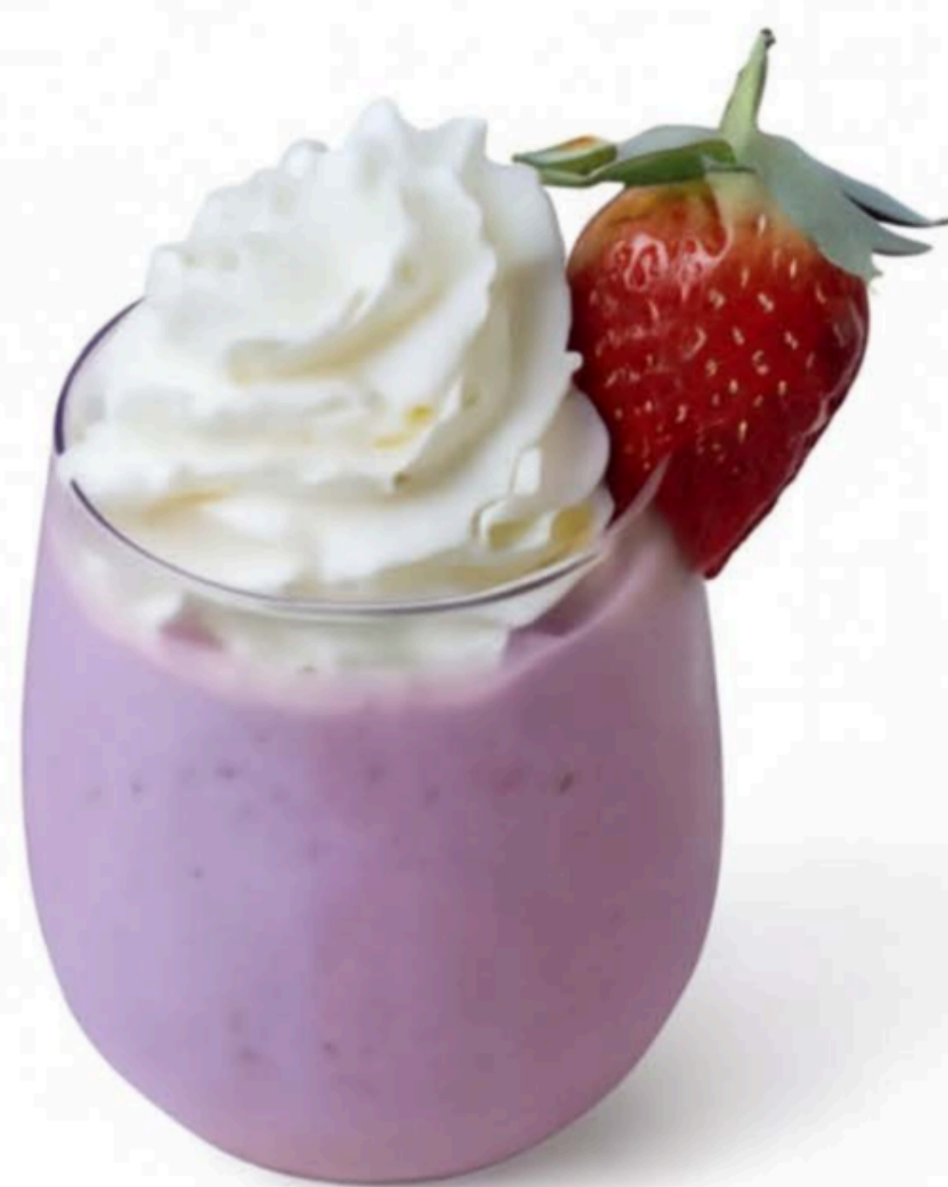
Strawberry Yogurt $8.80