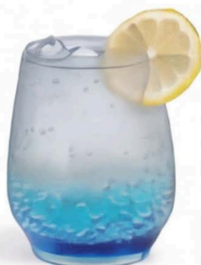
$8.80 Blue Lemonade