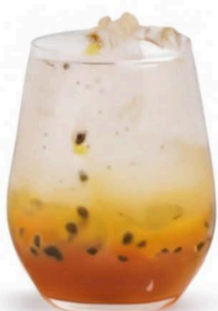
$8.80 Passionfruit Ade