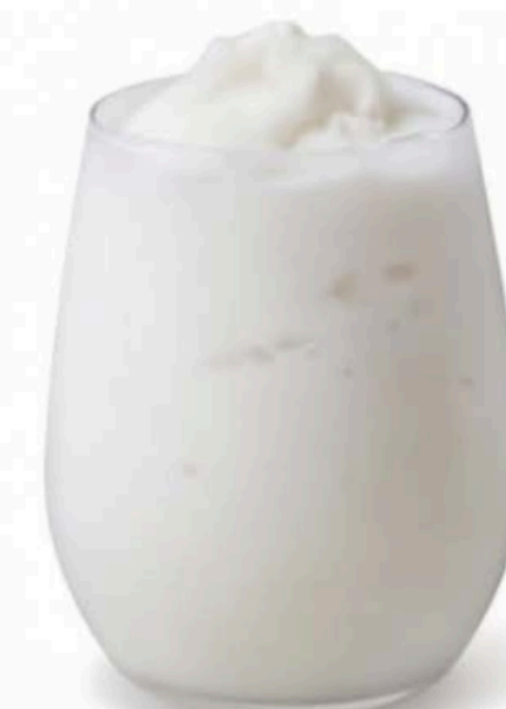
$8.80 Coconut Frappe