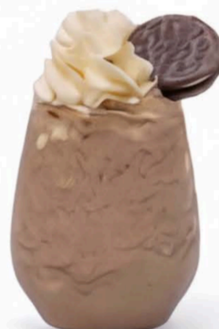
$8.80 Cookies and Cream